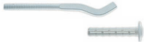
Mensola smaltata schiacciata per radiatore in alluminio Enameled smashed bracket for aluminium radiator