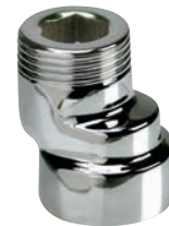
Raccordo eccentrico in ottone cromato MF 3/8" x 3/8" Chrome plated brass excentric connection MF 3/8" x 3/8"