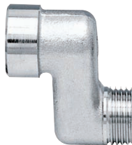
Raccordo eccentrico in ottone sabbato MF 3/8" x 3/8" Brass excentric connection MF 3/8" x 3/8"