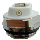
Valvolina sfiato per radiatore orientabile Breather drain for swinging radiator