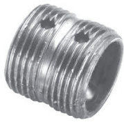
Nipples per radiatore Radiator nipple