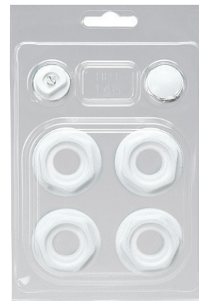
Set tappi e valvola per radiatore in blister flangia 42 ridotto