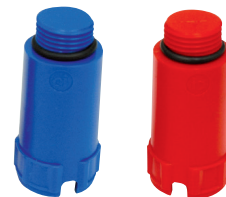
Tappo prova impianti in "PP" con o-ring da 1/2" Testing plug in "PP" 1/2" with o-ring