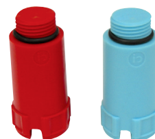
Tappo prova impianti in nylon da 1/2" con o-ring Testing plug in nylon 1/2" with o-ring