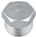
Tappo maschio in ferro zincato Galvanized iron plug