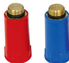
Tappo prova impianti filetto in ottone 1/2" con o-ring Testing plug with brass insert thread 1/2" and o-ring